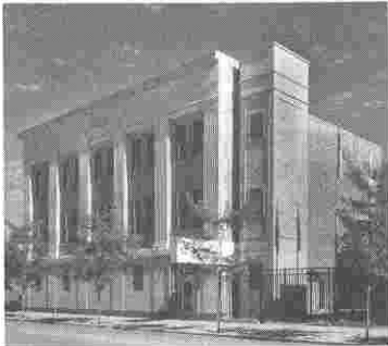
FOP, Chicago Lodge 7 1412 W. Washington Blvd.

"Although we are not satisfied at the time it took to get where we are, we are in a comparatively good position...."