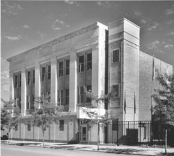
FOP, Chicago Lodge 7 1412 W. Washington Blvd.

The Official Publication of Chicago Lodge No. 7