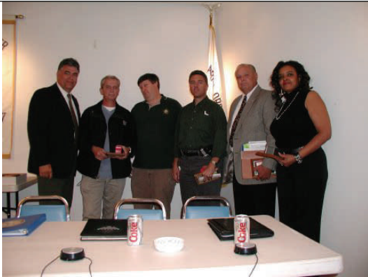
Former Board Members, of the 2002 - 2005 term, are recognized for their dedication and hard work while serving on the Board of Directors of Lodge 7.