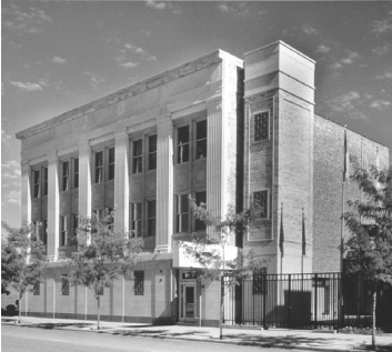
FOP, Chicago Lodge 7 1412 W. Washington Blvd.

"The Lodge is currently working on three very important legal issues for our member's interests."