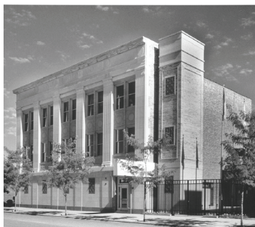
FOP, Chicago Lodge 7 1412 W. Washington Blvd.