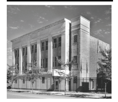
FOP, Chicago Lodge 7 1412 W. Washington Blvd.

"There has not been one additional consent decree levied at a Law Enforcement Agency nationwide since the Democrats last fell from power."