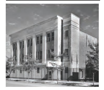
FOP, Chicago Lodge 7 1412 W. Washington Blvd.

"Please, don't assume somebody else called the FOP. We would rather get 100 calls than receive none in situations where your career could be at stake."