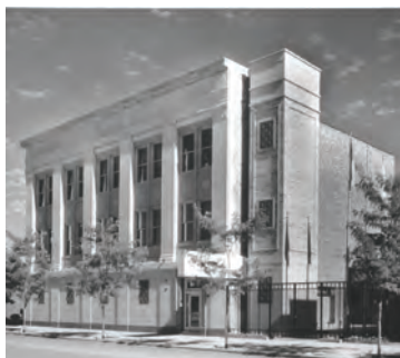
FOP, Chicago Lodge 7 1412 W. Washington Blvd.