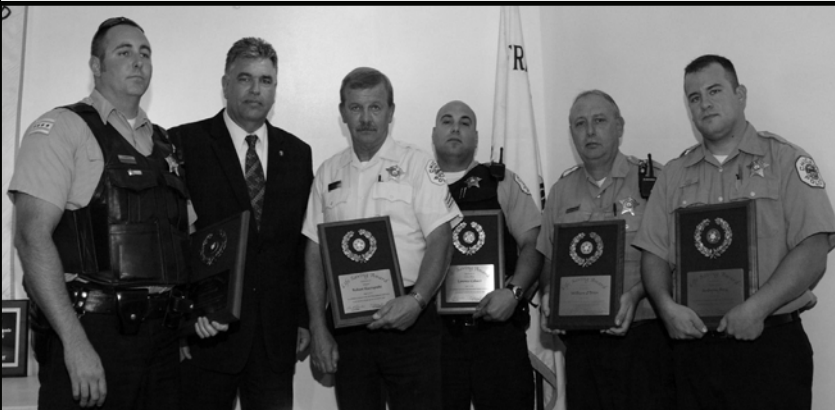
Life Saving Award