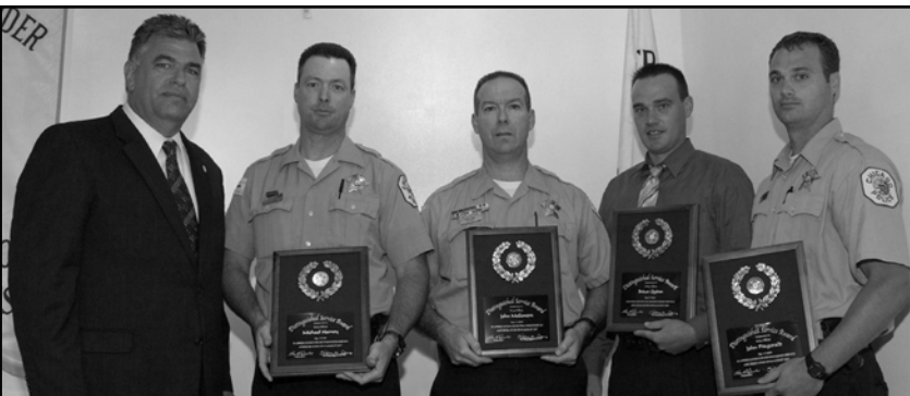
Distinguished Service Award