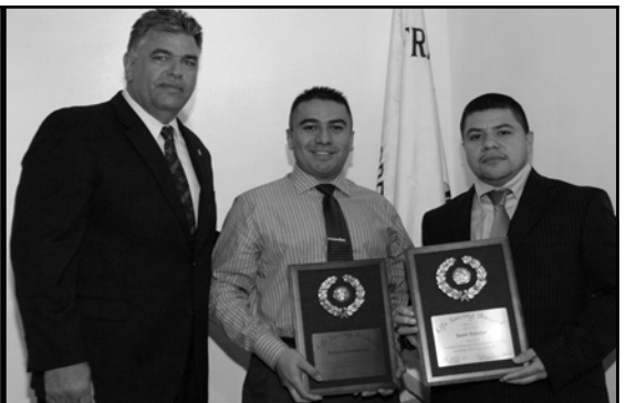
Life Saving Award