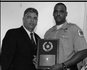
Life Saving Award