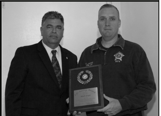
Life Saving Award