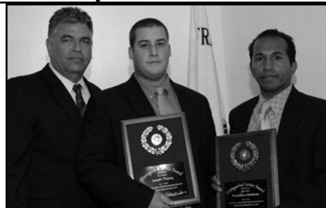
Distinguished Service Award