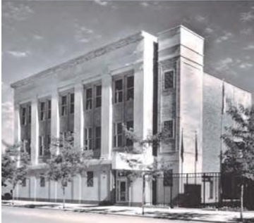
FOP, Chicago Lodge 7 1412 W. Washington Blvd.

Official Publication of Chicago Lodge No. 7