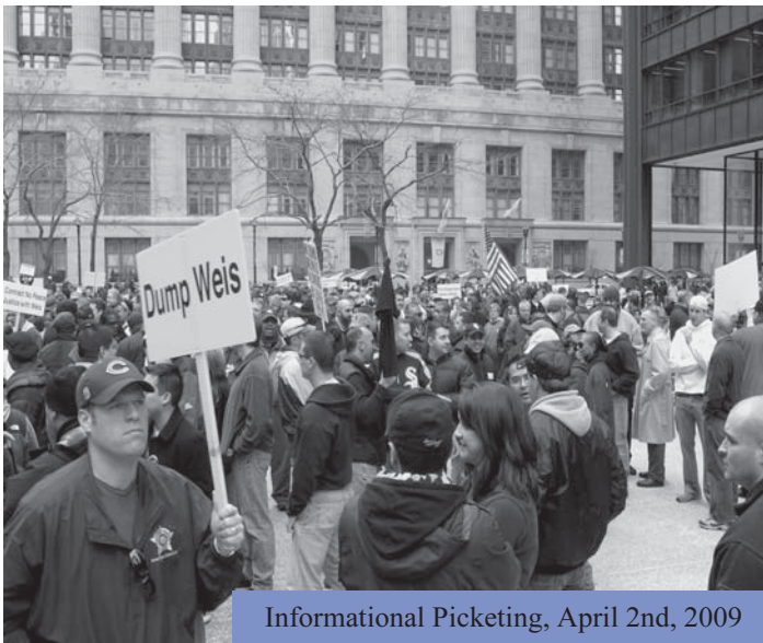
Informational Picketing, April 2nd, 2009