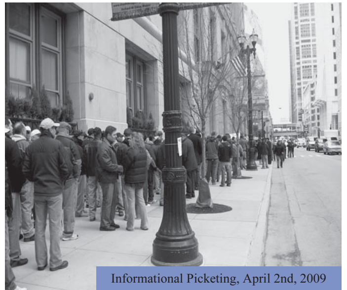
Informational Picketing, April 2nd, 2009