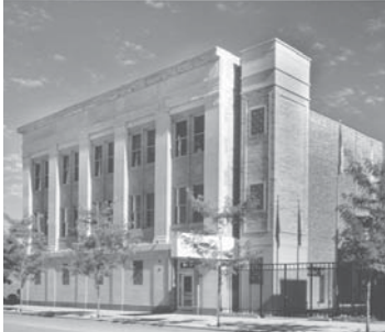
FOP, Chicago Lodge 7 1412 W. Washington Blvd.

Official Publication of Chicago Lodge No. 7