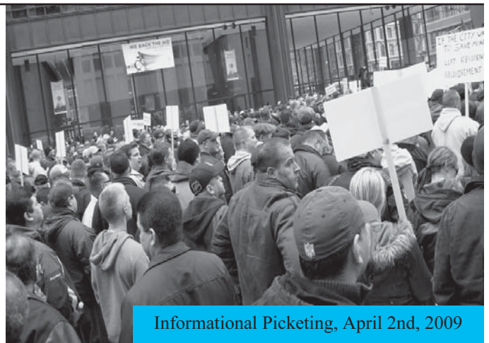
Informational Picketing, April 2nd, 2009

The entire opinion can be found on the United States Supreme Court website at www.supremecourtus.gov .