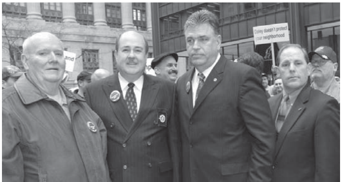
Informational Picketing, April 2nd, 2009

luncheon will be provided by the 018 th District following the ceremony so please call (312) 742-5778 if you are planning to attend.