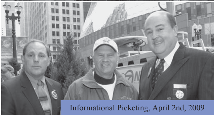
Informational Picketing, April 2nd, 2009