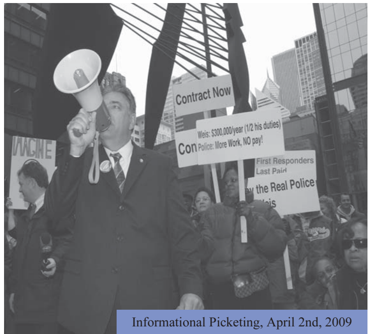
Informational Picketing, April 2nd, 2009

when the going gets tough! Next time maybe the media will get the count of those in attendance right.