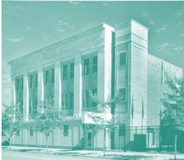
FOP, Chicago Lodge 7 1412 W. Washington Blvd.

Official Publication of Chicago Lodge No. 7