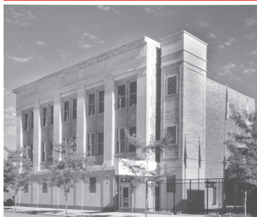
FOP, Chicago Lodge 7 1412 W. Washington Blvd.

Official Publication of Chicago Lodge No. 7