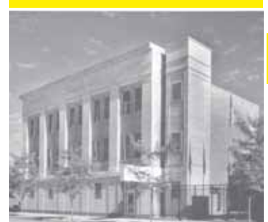
FOP, Chicago Lodge 7 1412 W. Washington Blvd.

"...it is now up to the Mayor to acknowledge that the City needs a major source of new revenue. City services are deteriorating across the board. City assets are, in effect, being sold off to prop up City finances over the short term. If the City pension funds do not start to receive hundreds of millions of dollars in increased contributions, they will go bankrupt. The current City finance structure is not sustainable."