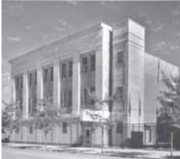
FOP, Chicago Lodge 7

Official Publication of Chicago Lodge No. 7