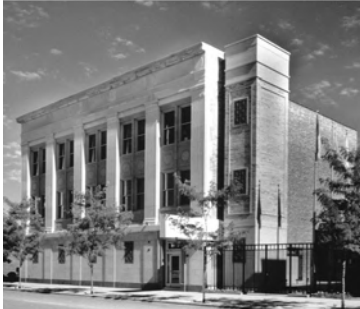
FOP, Chicago Lodge 7 1412 W. Washington Blvd.

Official Publication of Chicago Lodge No. 7 - 1412 W. Washington Blvd. Chicago, IL 60607-1821 Phone: 312-733-7776 FAX: 312-733-1367 www.chicagofop.org