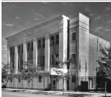
FOP, Chicago Lodge 7 1412 W. Washington Blvd.

Official Publication of Chicago Lodge No. 7 - 1412 W. Washington Blvd. Chicago, IL 60607-1821 Phone: 312-733-7776 FAX: 312-733-1367 www.chicagofop.org