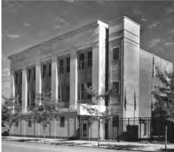
FOP, Chicago Lodge 7 1412 W. Washington Blvd.