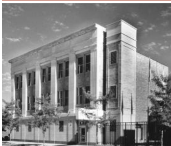
FOP, Chicago Lodge 7 1412 W. Washington Blvd.

Official Publication of Chicago Lodge No. 7 - 1412 W. Washington Blvd. Chicago, IL 60607-1821 Phone: 312-733-7776 FAX: 312-733-1367 www.chicagofop.org