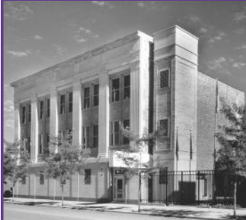
FOP, Chicago Lodge 7 1412 W. Washington Blvd. Chicago, IL 60607-1821