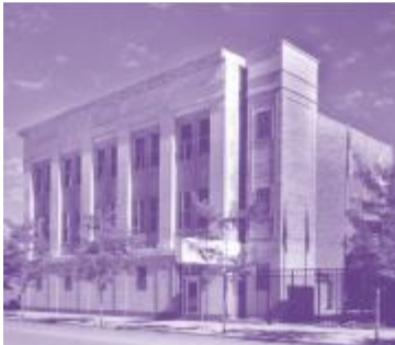
FOP, Chicago Lodge 7 1412 W. Washington Blvd.

Official Publication of Chicago Lodge No. 7