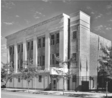
FOP, Chicago Lodge 7 1412 W. Washington Blvd.