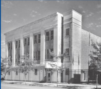
FOP, Chicago Lodge 7 1412 W. Washington Blvd. Chicago, IL 60607-1821